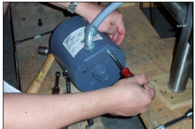
Removing the wiring access cover.